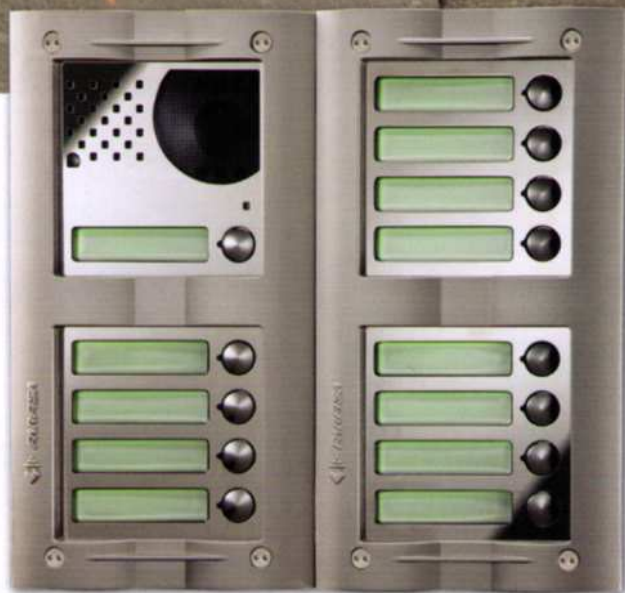
VIDEO INTERCOM COMPOSITION

Modern and elegant, Matrix Style is the modular range for solid and antivandal door station, today renewed in finishes and materials. The series is composed by stainless steel front plates and push buttons, conceived to be resistant to breaking, water spout and solid penetration. These technical specifications are granted by IP45 for solid items introduction protection and IK09 degree for mechanical shocks. Today Matrix Style is enriched with up-to-date colours and finishes, evoking lightness in its renowned sturdy structure. Front frames are now available even in matt titanium grey colour, while the plates are mirror-polished, that combine elegance and long-standing life. All the modules are backlit thanks to green LED's for easy identification especially in poorly illuminated situations. The modularity allows installations of great number of users and configurations in vertical or horizontal way. The range is complete with aluminium front frames and built-in or surface mounting boxes. In a single module can be integrated push button, door speaker and camera, so that Matrix Style can be