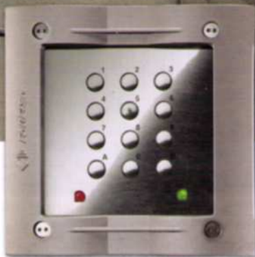
FC52MAS + MAS61