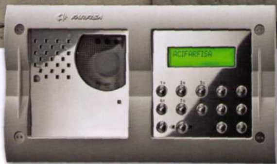
VIDEOINTERCOM COMPOSITION WITH DIGITAL CALL BUTTONS